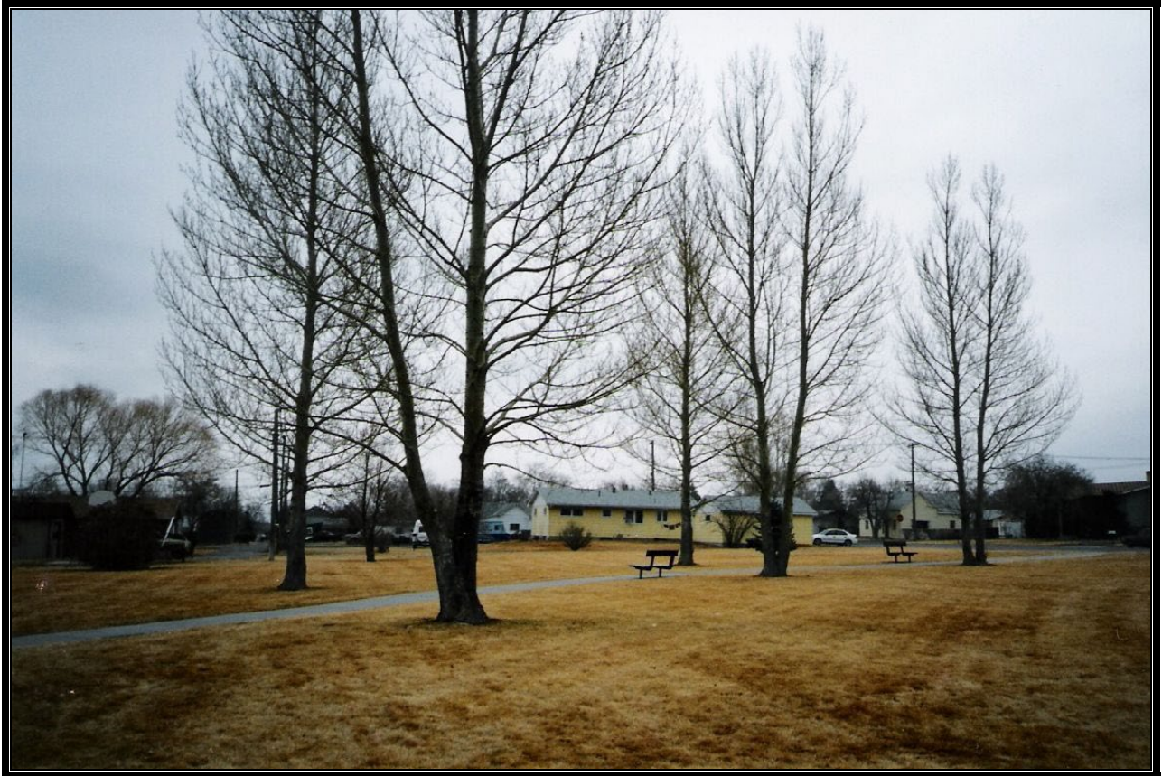
After 1972, Robinson Park today