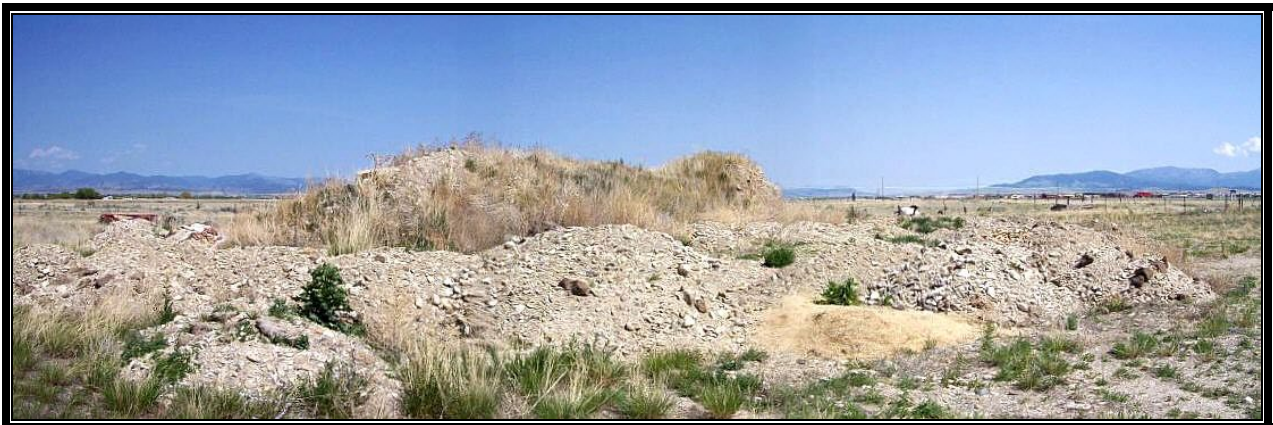
Resurrection Cemetery - the pile of tombstones now buried under dirt

When the City of Helena put in the sewer line on Livingston Avenue, they dug up coffins and bones, threw them in a dump truck and left the metal coffins. It is unknown where they dumped the remains.