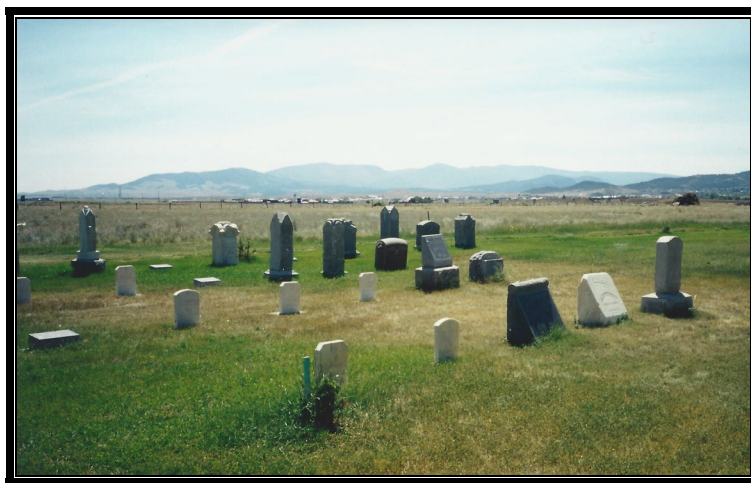
Stones from St. Mary's set up in Resurrection, no bodies, just stones.