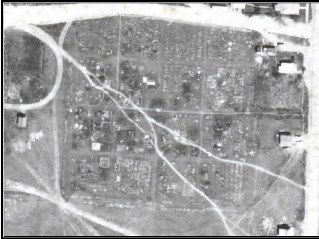
Aerial view 1960