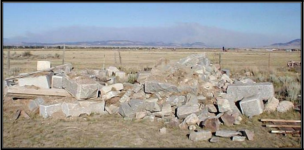
Resurrection Cemetery - the pile of tombstones on the east side of the cemetery away from the main cemetery